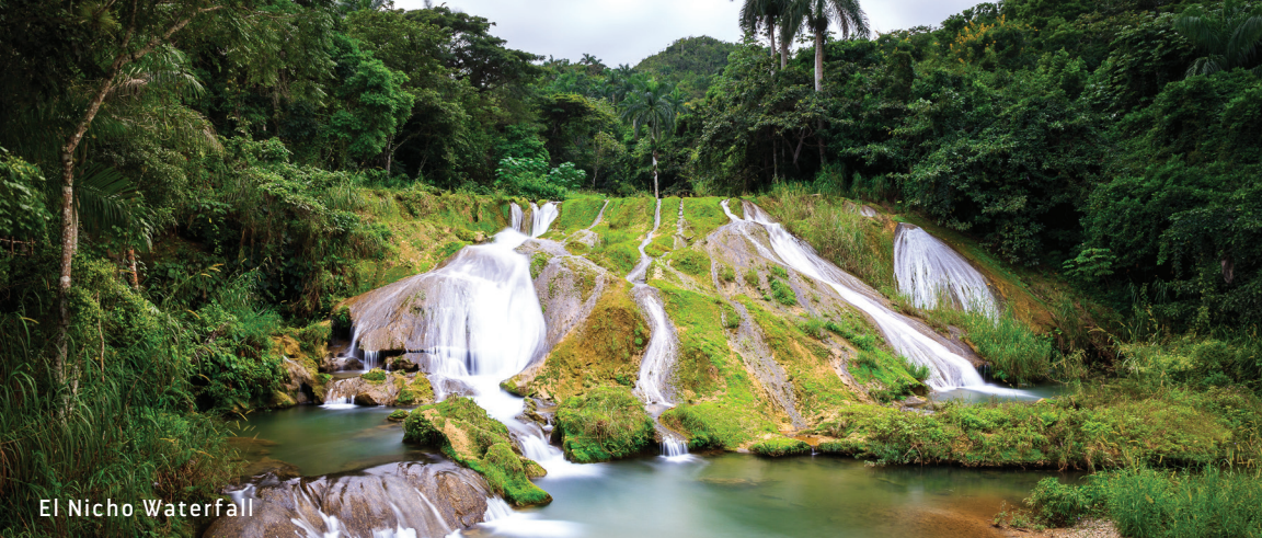
El Nicho Waterfall