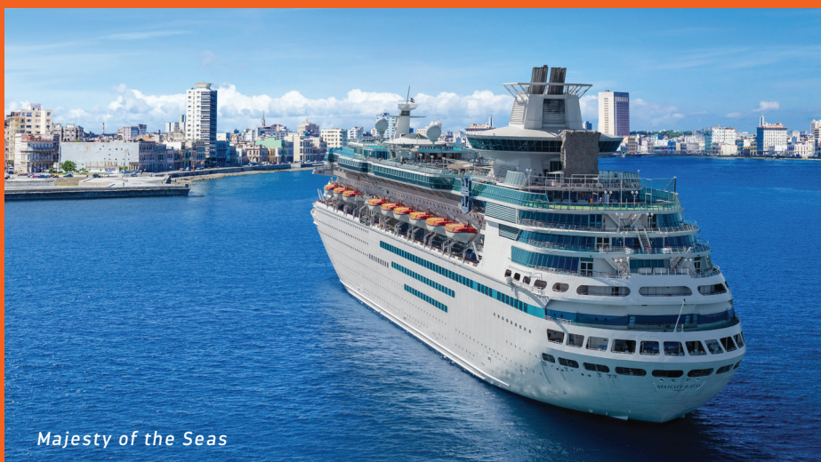
Majesty of the Seas