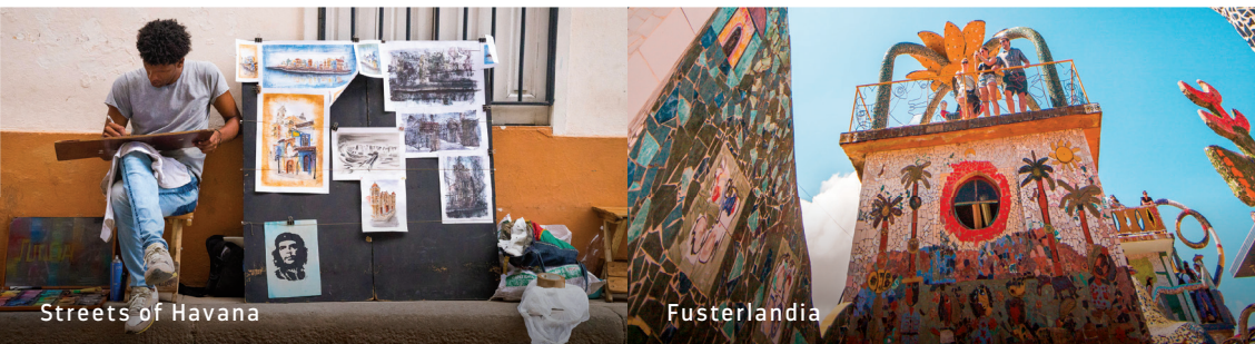
Streets of Havana

Havana Jazz Night — Get lost in the rhythm and romance of Havana as you spend an evening amid a nightclub ambiance filled with Afro-Cuban jazz tunes by a local band.