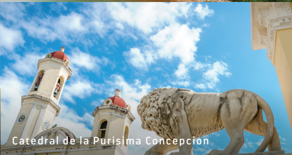
Catedral de la Purísima Concepción