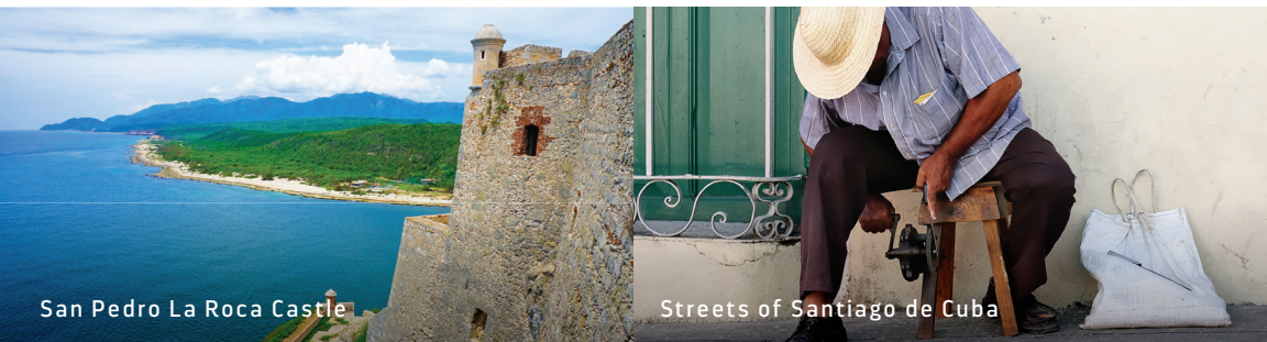
San Pedro La Roca Castle

Panoramic Santiago City Tour — Enjoy plenty of photo stops around Santiago's cityscapes at San Juan Hill, Moncada Barracks, Cespedes Park, El Morro castle and other notable landmarks.